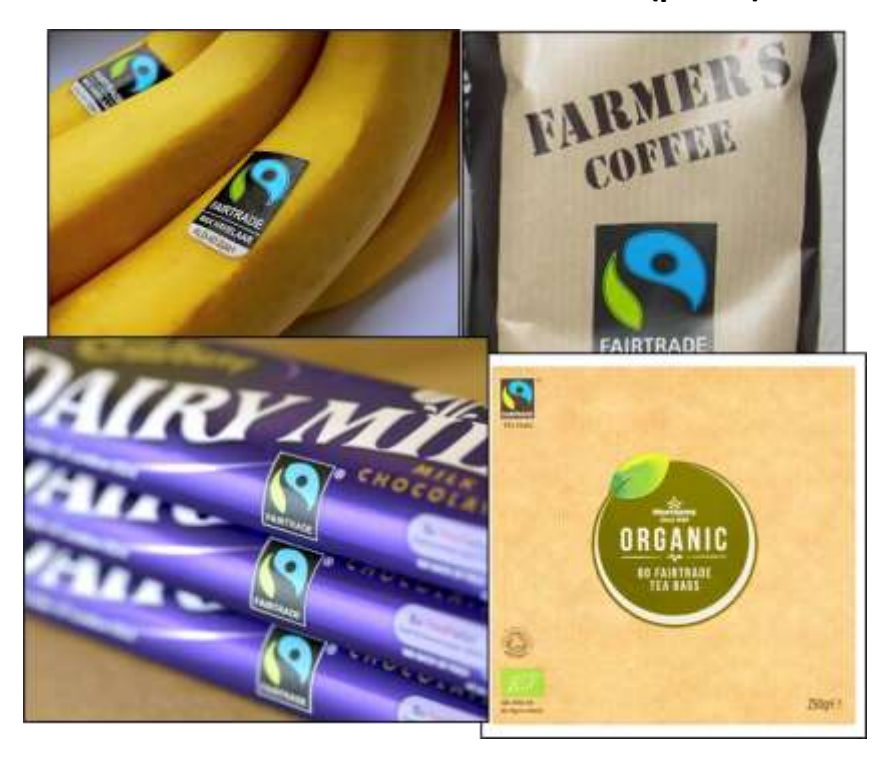
Lesson 5 – How to make trade fair (part 1)?